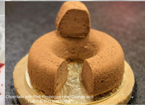
Chocolate, Pink peppercorn & Orange Zest $24.00. (SKU: PM0013-CC)

Ingredients content: Dairy Products, Eggs, Sunflower Oil, Flour, Citrus, Fruits Powder & Sugar.