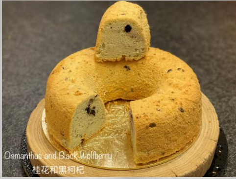
Osmanthus & Black Wolfberry $28.00. (SKU: PM0013-OB)

Ingredients content: Flower petals, berries, Dairy Products, Eggs, Sunflower Oil, Flour & Sugar