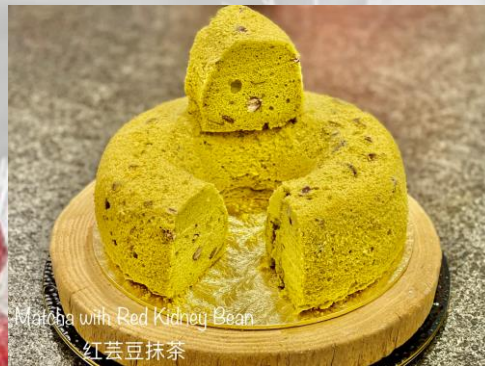
Matcha & Red Kidney Bean $20.00 (SKU: PM0013-MR)

Ingredients content: Dairy Products, Eggs, Sunflower Seeds, Flour, Citrus, Tea Powder & Sugar.