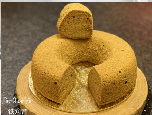
TieGuanYin Tea $16.00. (SKU: PM0013-TGY)