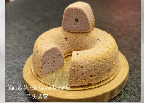
Yam & Purple Sweet Potatoes $27.00. (SKU: PM0013-YS)

Ingredients content: Spices, Dairy Products, Eggs, Sunflower Oil, Flour, Spices, Tea leaf & Sugar.