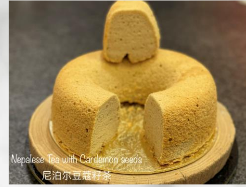
Nepalese Tea & Cardamom seeds $16.00. (SKU: PM0013-NT)

Ingredients content: Coconut cream, Gula Malacca & Coconut Oil Products, Eggs, Flour, Citrus, Sugar.