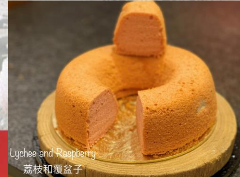
Lychee & Raspberry $20.00. (SKU: PM0013-LR)

Ingredients content: Dairy Products, Eggs, Sunflower Oil, Flour, Citrus, Matcha Tea Powder & Sugar.